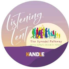
TABLE RECORDER TEMPLATE Conversation Three: Mission

This is about how we are sent out into the everyday stuff of our lives to tell others about the Good News of our faith by what we do as well as by what we say.